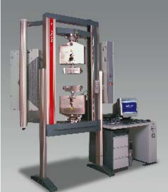
Table-top machines Z030 up to Z100 of the Allround-Line